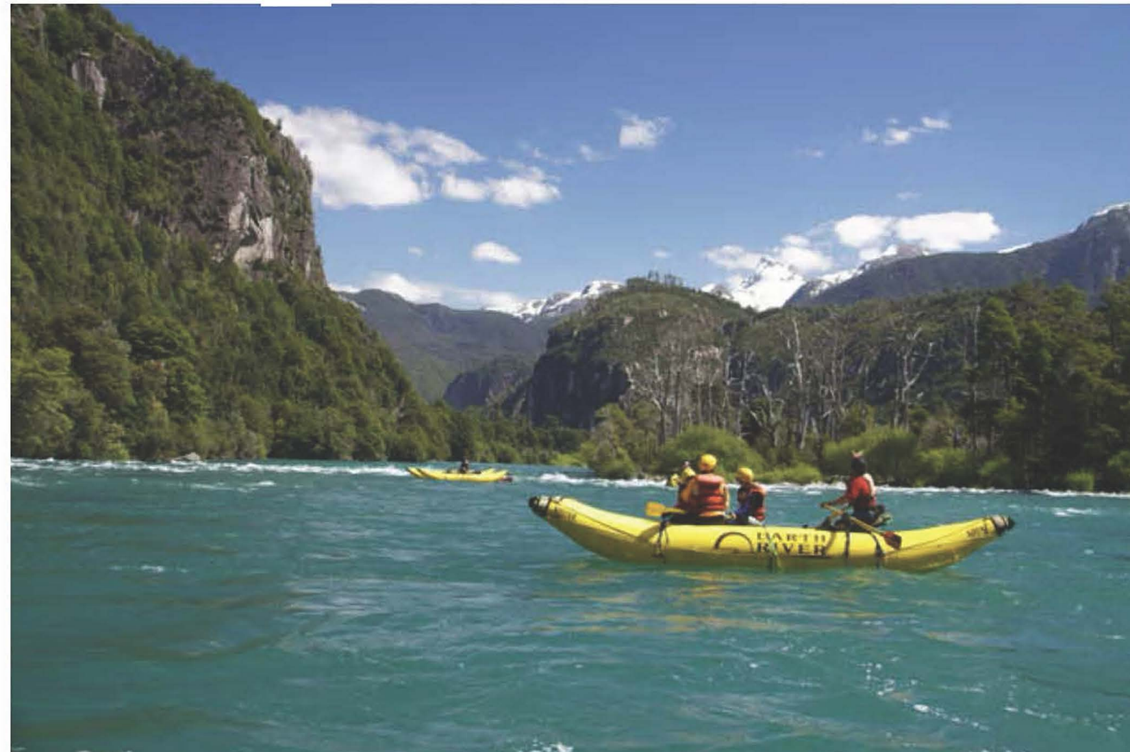
Take in the gorgeous Patagonian scenery from the Futaleufu (EARTH RIVER)